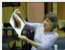
CONTINUE TO TILT LETTING COLORS BLEND