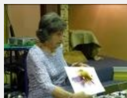
TIP AND THEN LET RUN TOGETHER