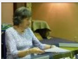
THREE COLORS ADDED